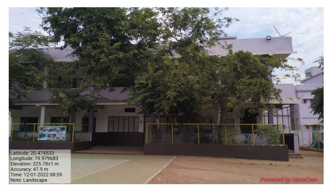
In front of old building were planted some ornamental plant in small arches viz.Cycas revoluta, Tabernemontena diverticata, Dypsis lutescens (Areca palm), Codiaeum variegatum (Croton) and Ravenala madagascariensis, Rosa indica (Gulab), Tecoma stans