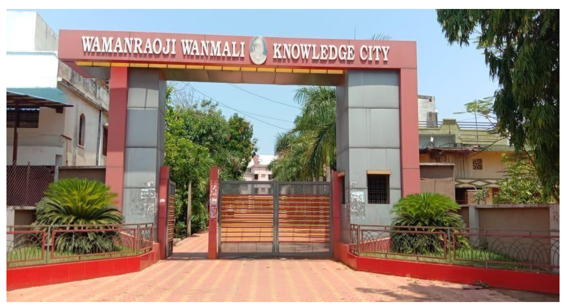
Well-developed Cycas plants on each side of college entrance gate.