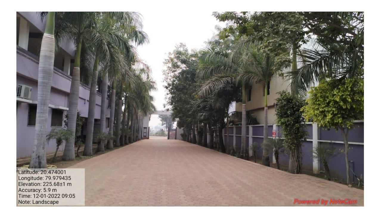
Royal palms alternating with phoenix of each side of rode between college entrance to administrative office.