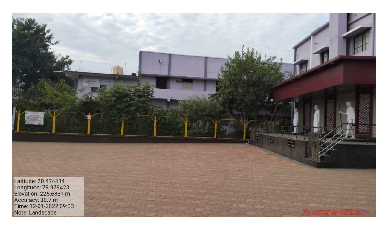
In front of administrative building of the college herbal garden is well established.